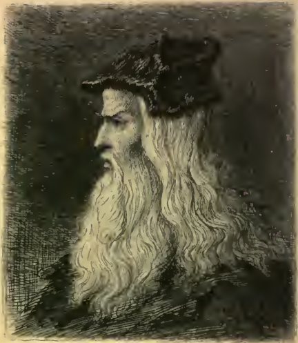
Scult. Flaminio Leonardo da Vinci